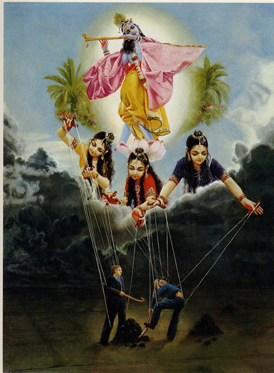
Plate 2 "You are eternally the master of the three modes of material nature; thus You are always different from the ordinary living entities." (p. 382)