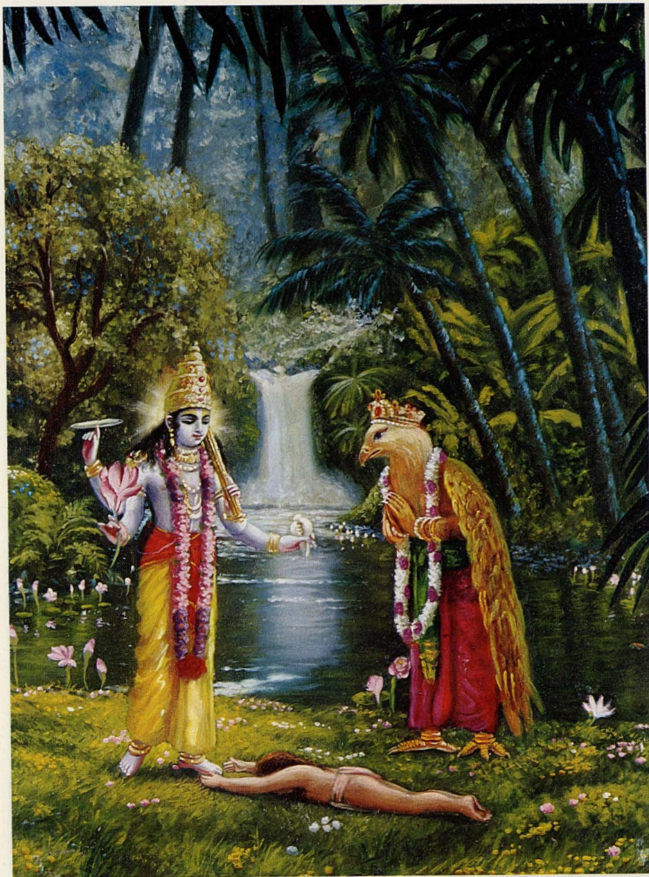
Plate 1 Dhruva fell flat before the Lord like a rod and became absorbed in love of God. (p. 363)