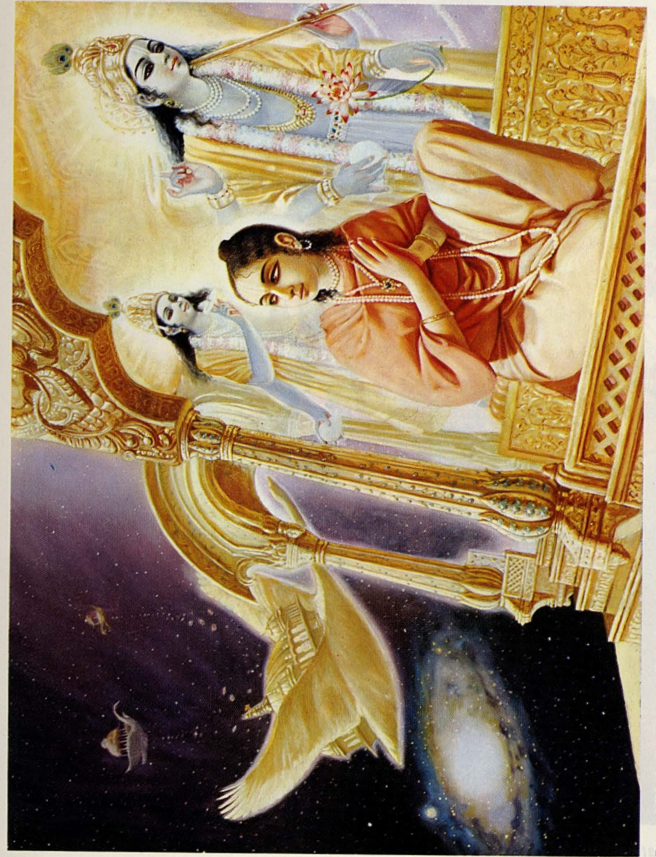
Plate 6 While Dhruva Mahārāja was passing through space, he gradually saw all the planets of the solar system. (p. 527)

The Supreme Personality of Godhead (p. 622)