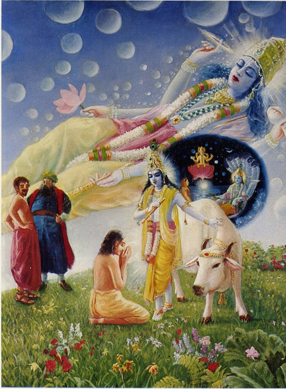
Plate 5 The Supreme Lord is transcendental to this material world; therefore only a fool thinks of Him as an ordinary human being. (p. 477)