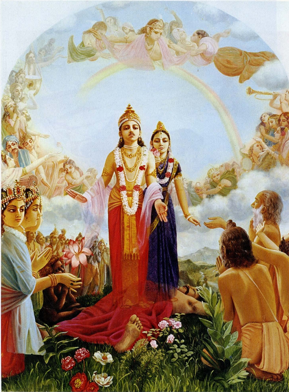
Plate 7 The male and female born of the arms of Vena's body were an expansion of Viṣṇu, the Supreme Personality of Godhead. (p. 622)