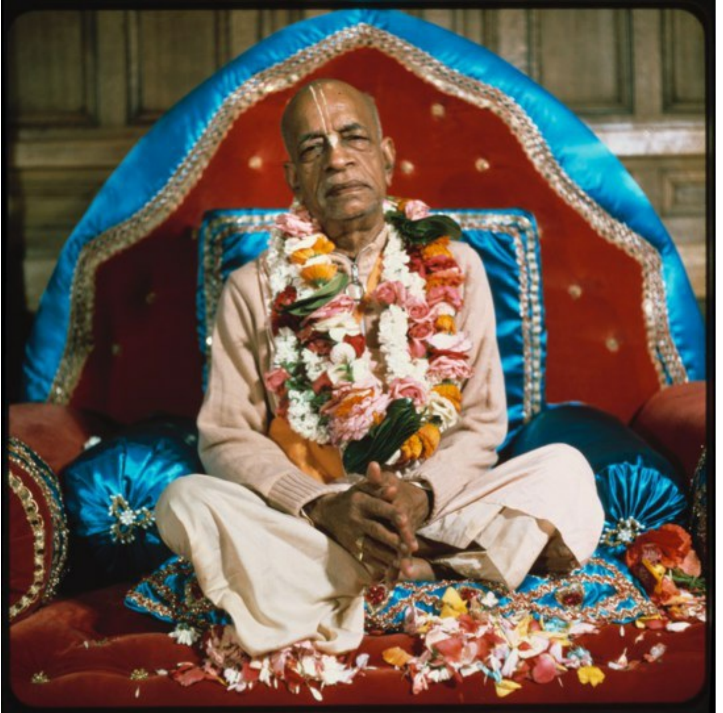
His Divine Grace A.C. Bhaktivedanta Swami Prabhupāda Founder-Ācārya of the International Society for Krishna Consciousness